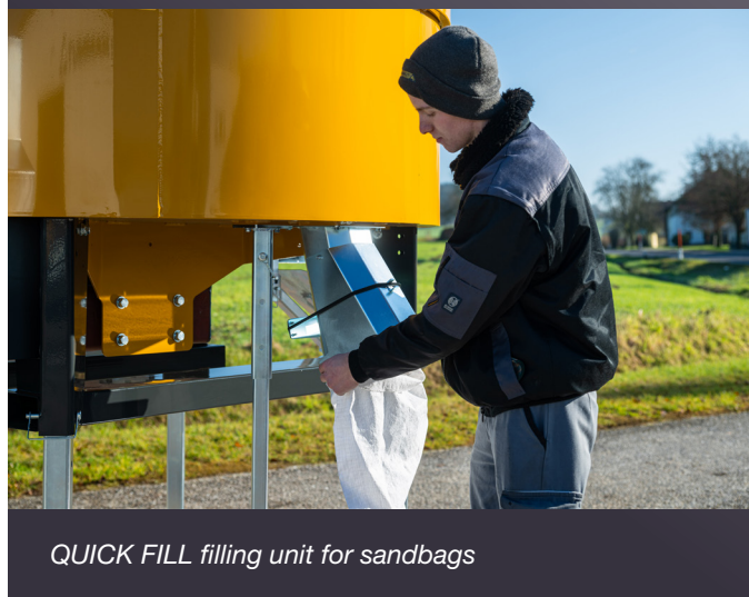
QUICK FILL filling unit for sandbags